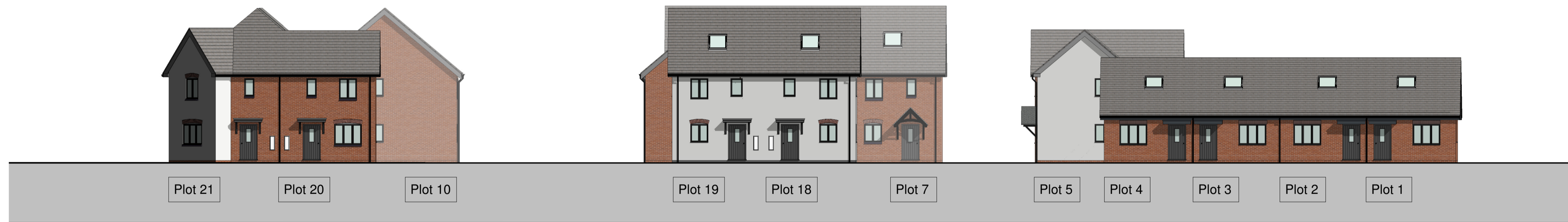
Waverley Lane 1 : 150